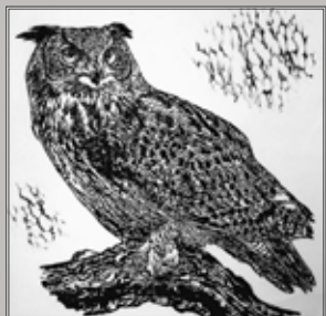
Artist reception—Sunday, April 2, 1–3 pm Details on page 7.

March 4–May 23 Lost Valley Visitor Center, Glacial Park