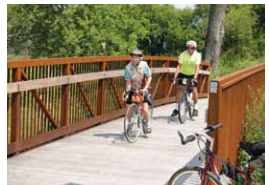
Pictured above: site tour at the Grand Opening of High Point Conservation Area, Harvard; biking on the Stone Mill Trail, Chemung