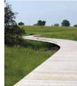
Pictured above clockwise: High Point Conservation Area, Harvard; new fire pit at Nippersink Canoe Base Conservation Area, Spring Grove; boardwalk at Kishwaukee Headwaters Conservation Area, Woodstock; and ribbon cutting at Kishwaukee Headwaters