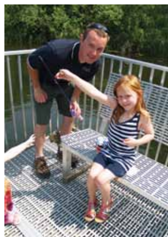
Left: Winding Creek Conservation Area, Hebron; fishing at the Grand Opening of Winding Creek