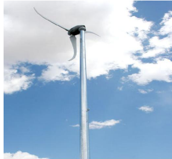
SKYSTREAM 3.7 – 2.4 kW