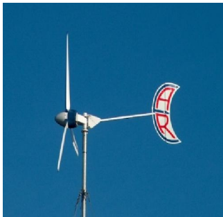
ARE 110 – 3.5 kW