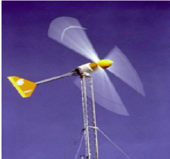
Bergey Excel – 10 kW