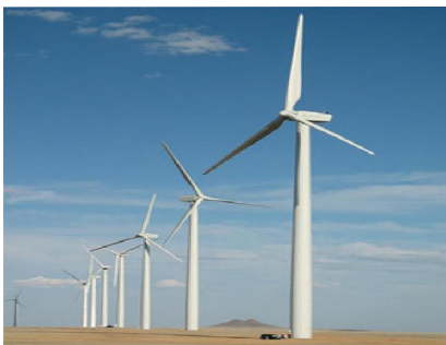
GE SLE – 1.5 MW