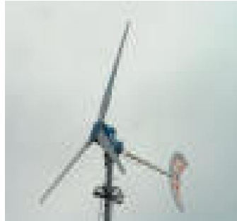
ARE 442 – 10 kW