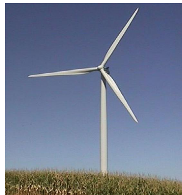
NORDTANK – 150 kW