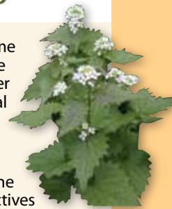
Invasive Garlic Mustard

Programs are held Saturdays, 9:00 a.m.–4:00 p.m., Cost: $50. Much of the day is spent outdoors, come prepared for the weather. Bring a lunch and something to drink.