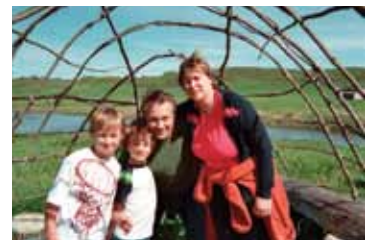
Photo taken at a cache in Glacial Park

Completed entries must be returned by November 30, 2011. Some caches will remain posted on www.geocaching.com .