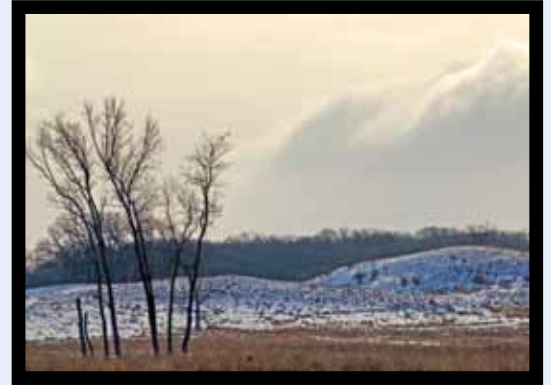
Glacial Park

The Illinois Nature Preserves Commission's traveling photo exhibit Illinois Nature Preserves and Land and Water Reserves commemorates 500 protected sites. Twenty-two exceptional photographs are on display and were selected from a slate of 225 photos submitted for the Illinois Department of Natural Resources' 2009 Outdoor Illinois Photo Contest. All of the entries represented Illinois' extraordinary geographic range of biodiversity. The Commission appreciates this opportunity to share these images of Illinois' natural treasures. For more information on the traveling exhibit go to tinyurl.com/4koochn .