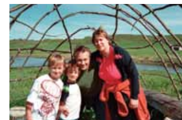
Photo taken at a cache in Glacial Park

Caches will be placed in 15 different Conservation District sites. Sign-up to receive a list of coordinates and a questionnaire which will be sent in late July; however, caches will not be in place until August 1. Each cache will contain an answer to a corresponding question. Some caches will be posted on www.geocaching.com . You will need your own GPS unit to complete the program.