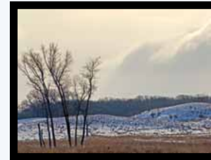
Glacial Park

July 2–October 30 Lost Valley Visitor Center, Glacial Park