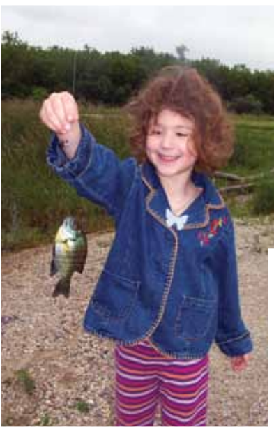
Snapshots from last year's event!